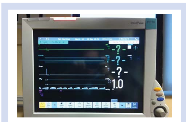
Fig 2 Capnography during CPR in a patient in cardiac arrest. The attenuated capnography trace is seen when pulmonary ventilation is occurring. A flat capnograph trace should be assumed to be because of oesophageal intubation (or rarely airway blockage) until this has been actively excluded.